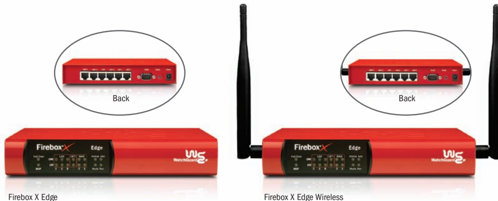
Firebox X Edge